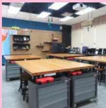
NPTU Maker Space