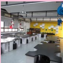
Hands-on Science Learning Center