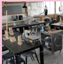
Teaching Aid Prototype Factory