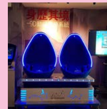
VAR Technology Center