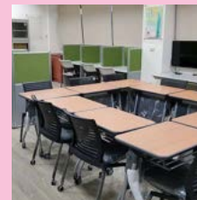
Communication and Cognition Lab.