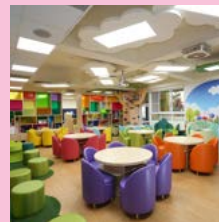
Children's Science Exploration Classroom